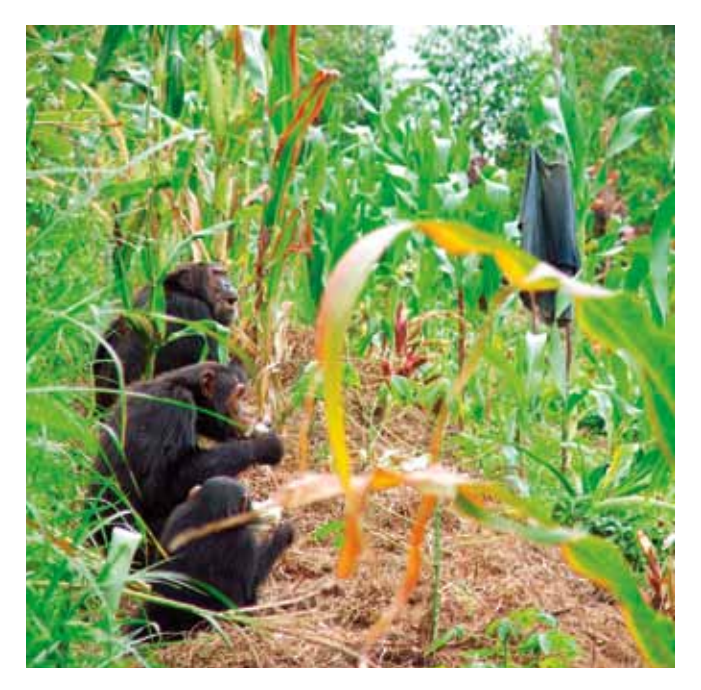
Chimpanzees in a maize field where local people have placed a simple scarecrow.

Traditional fencing has proven ineffective for excluding great apes from fields. In some regions, fencing is combined with wire snares set between pickets to capture raiding rodents, and these snares constitute a danger to great apes. In Uganda, one quarter of chimpanzees in two habituated communities (Budongo and Kibale) have snare related injuries (Wrangham and Mugume 2000; Plumptre et al. 2003; Reynolds 2005). Although chimpanzees can escape by dislodging a wire from the release mechanism, the wire often remains tight around the trapped limb, resulting in severe short- or long-term handicap, limb loss or even in some cases the death of the individual. Remarkably at Bossou in Guinea, chimpanzees have learned to dismantle wire snares by triggering the release mechanism without contacting the snare (Ohashi 2005). Clearing an area of 2–5 m around fences to enhance visibility may help great apes to avoid snares while aiding human guards to more effectively monitor their fields. Clearing around fences may also discourage shyer individ-