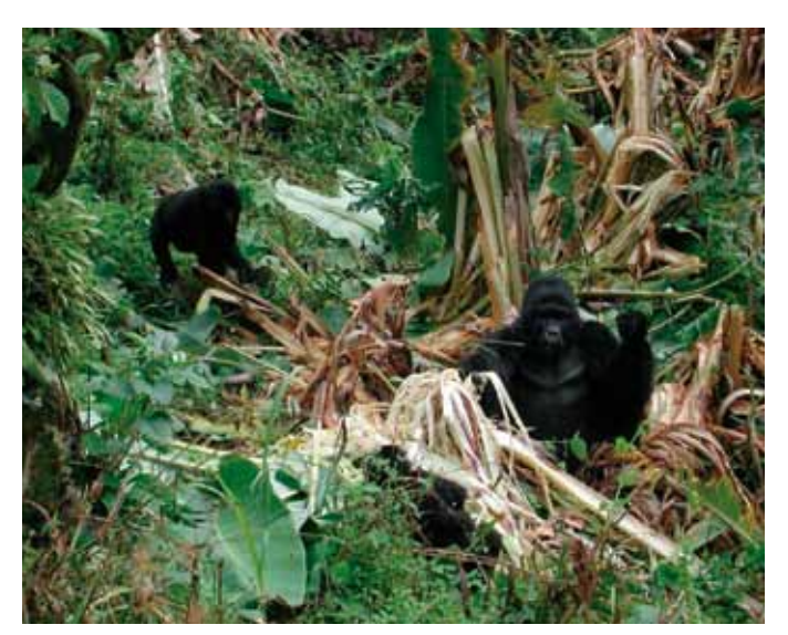
Mountain gorillas devastate a banana grove in Uganda.

HGAC situations can escalate when local people or institutions are unable to deal with the conflict effectively. Where possible, people assigned to resolving a conflict situation should already have, or be trained to acquire, the necessary expertise. Furthermore simply arriving at a site and taking an interest in HGAC can lead to problems in itself, since it immediately raises expectations that a solution will be forthcoming (e.g., capture and relocation, compensation), and can lead to repercussions if it is not (Naughton-Treves and Treves 2005; Treves et al. 2006). In certain cases, and depending on the research objectives, data might be collected without leading farmers to think that the HGAC is the main point of investigation (e.g., a survey of general rural agricultural problems for farmers). Addressing complex problems within Protected Areas requires a level of training and expertise that is rarely met by the authorities. Management decisions intended to mitigate HGAC require consultation with great ape experts whenever and wherever appropriate. For example, Nishida (2008) suggested that the Tanzanian National Park authority's decision to remove