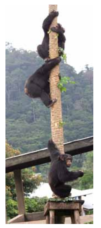
Adult male chimpanzees feeding on papaya in a village.