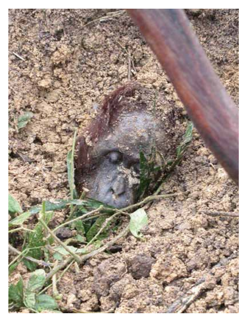
This adult female orangutan was uncovered in a newly-planted oil-palm plantation after a rescue team received a call about an orangutan in the vicinity. When they arrived on site, plantation workers denied seeing an orangutan, but they were nervous and one glanced at a freshly dug area. Only a few inches below the surface, the rescue workers found the orangutans still-warm body. A post mortem examination indicated she had been beaten unconscious and buried alive.

In Gabon, the central subspecies of chimpanzee ( P. t. troglodytes ) occasionally feeds on crops, but Lahm (1996) did not quantify this. Savanna-dwelling western chimpanzees ( P. t. verus ) overlap substantially with humans in their use of forest resources. Chimpanzees