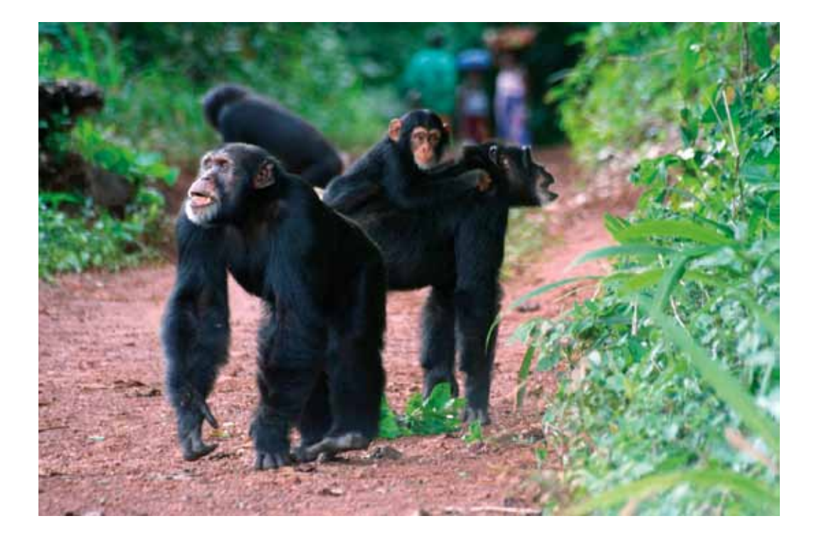
Chimpanzees cross roads and paths, which brings them into contact with people.

Contrasting values between affected local people and households, wildlife managers, and wildlife protection interests are the most common causes of political disagreements over human-wildlife conflict (Richards 2000; Treves 2008). It is therefore necessary to establish whether the HGAC problem is politically linked to other issues, such as local hostility towards conservation authorities, or disagreements among people related to empowerment and resource access (Treves et al. 2006). For example, when the Ugandan Wildlife Authority started to earn significant revenue